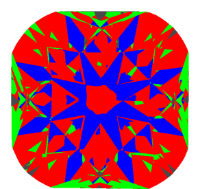
Key to Symbols Cloud Pinpoint •